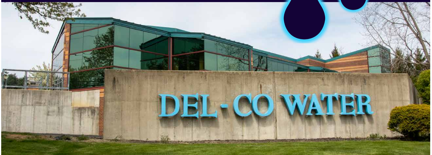
Del-Co Water services seven counties in central Ohio, providing water to over 150,000 people.